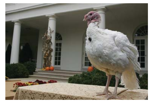
This turkey became the grand marshal of a Thanksgiving Day Parade

Okay, so you don't want to go vegetarian and pardon the turkey - unlike the White House Turkey here. But you can do some simple things to green your Thanksgiving.